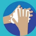
SCRUB: 20 SECONDS